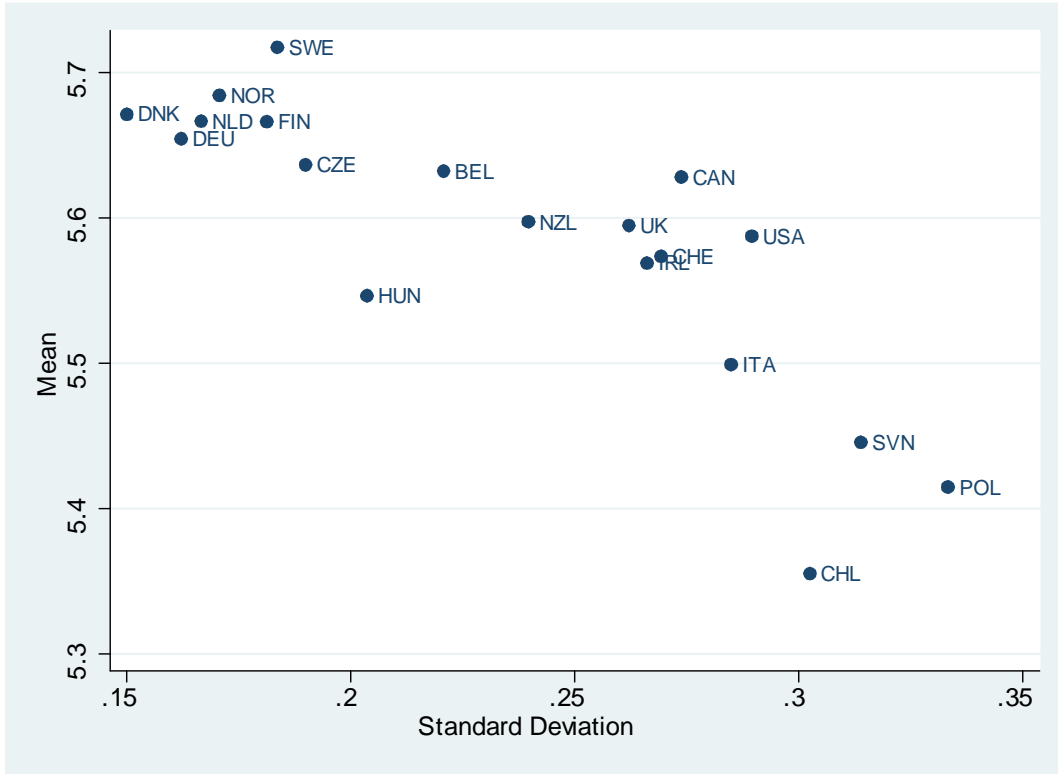
Figure 1: Mean and Dispersion in IALS log-scores (1994-1998)